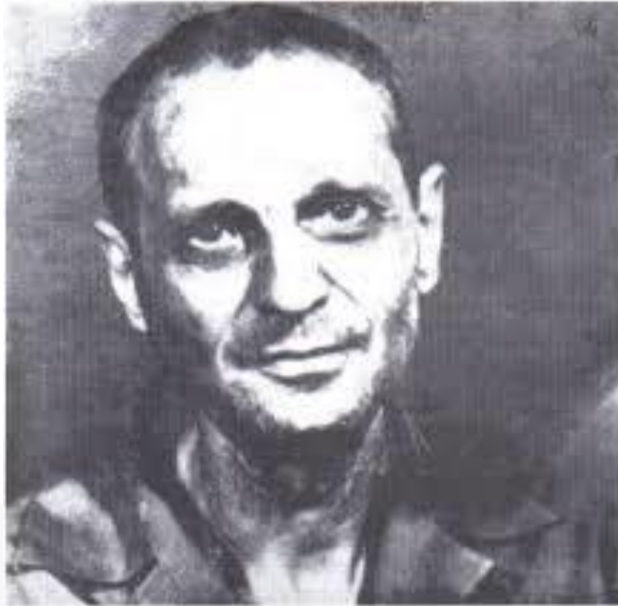
Richard Wurmbrand at the time of his imprisonment.